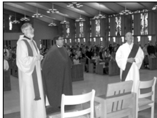
The two campuses come together to celebrate Mass for Catholic Schools week at St. Augustine's Church on Friday, February 4, 2011.