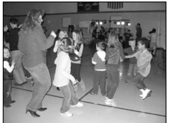
Students, parents and staff from both campuses join in celebrating Catholic Schools Week at the Family Dance on Friday, February 4, 2011.