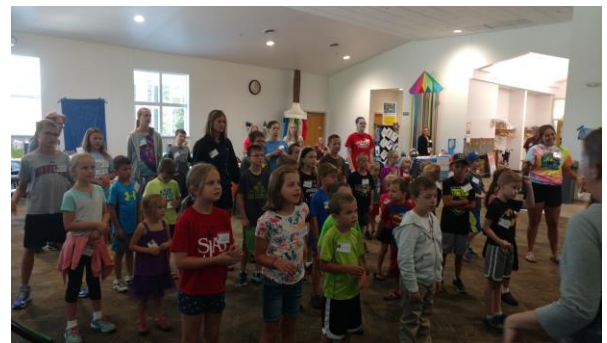
Vacation Bible School